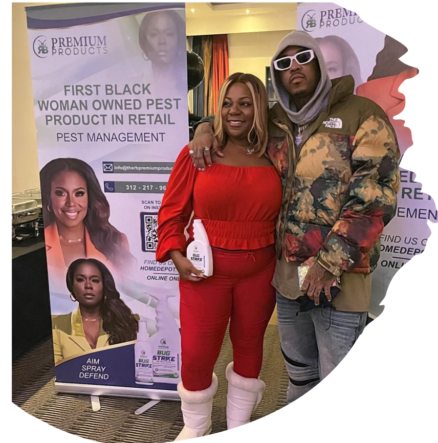
JEREMIH W/ LADY J